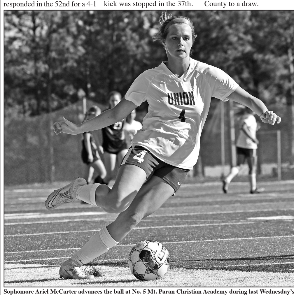
Sweet 16 matchup.