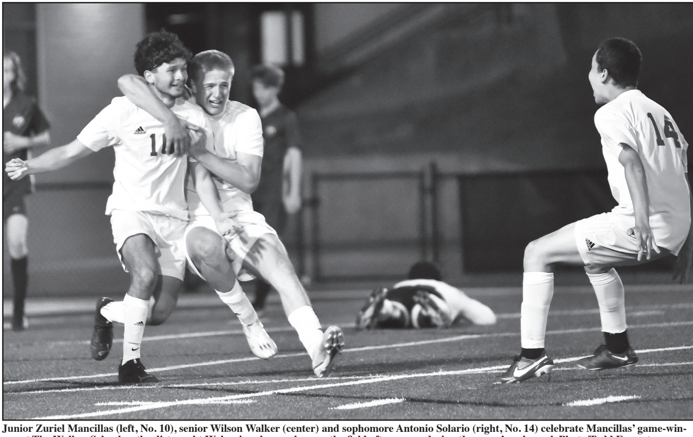
ner at The Walker School as the distraught Wolverines keeper lays on the field after surrendering the game's only goal.

'It's a good feeling being back in the Elite Eight, but now we have to win, because our