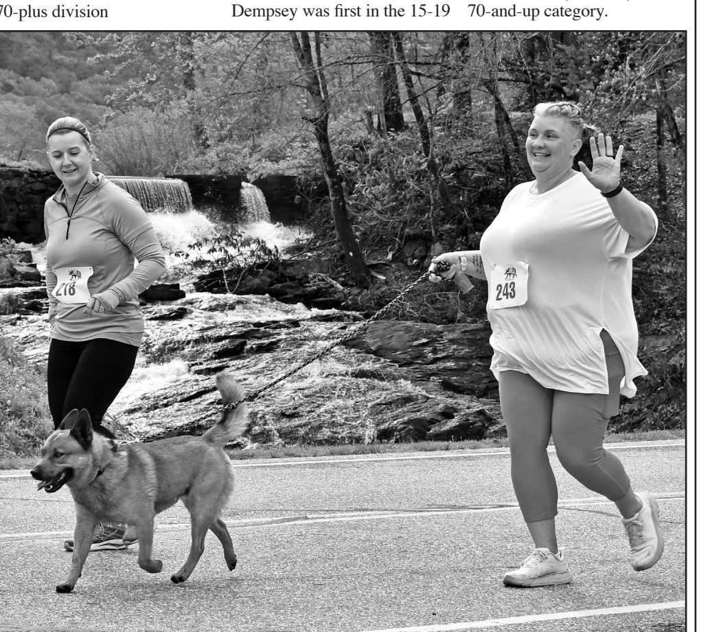
Runners, two-legged and four-legged, tackled the scenic course last weekend in Suches. Additional RATC photos will be included in next week's North Georgia News.

When close to 100%. advantage to 2-0 in the 24th Union County flashed its potential when they battled Class AAA's then-No. 3 Dawson